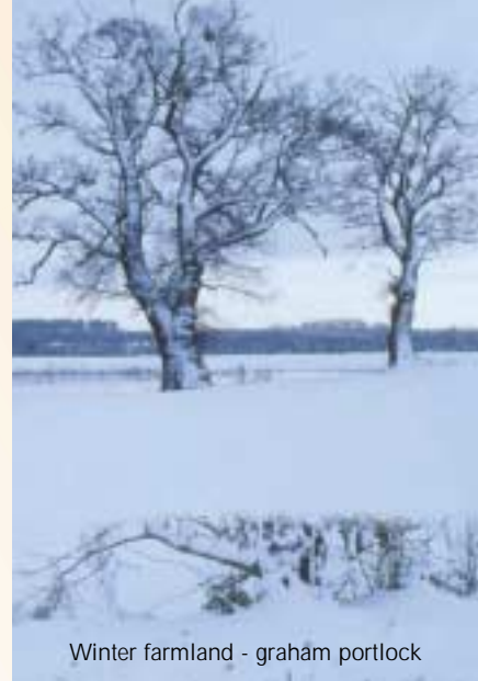
Winter farmland - graham portlock