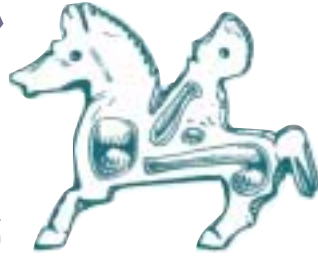
Romano-Celtic horse & rider brooch, from Hockwold