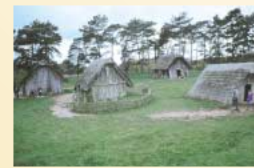
West Stow Anglo-Saxon Village

Reconstructed early Saxon village on site of excavated settlement. Different types of buildings represented, together with demonstrations of animals and crops of the Saxon period. All set within a 120 acre / 50 hectare country park with lake and nature trail. Visitor Centre and Anglo-Saxon Centre, with café, toilets (with disabled access). Programme of events. Nature trail and bird hide. Small entry charge for Village. Open daily 10 am to 5pm. Access from A1101 via minor road. Tel: 01284-728 718.