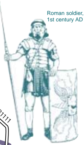
Roman soldier, 1st century AD