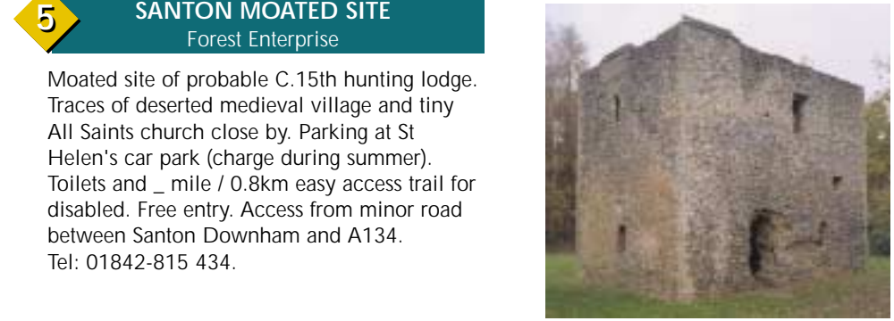
Thetford Warren Lodge

Moated site of probable C.15th hunting lodge. Traces of deserted medieval village and tiny All Saints church close by. Parking at St Helen's car park (charge during summer). Toilets and 1/2 mile / 0.8km easy access trail for disabled. Free entry. Access from minor road between Santon Downham and A134. Tel: 01842-815 434.