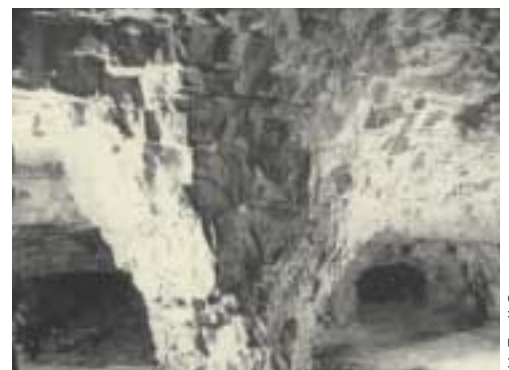
Underground galleries at Grimes Graves