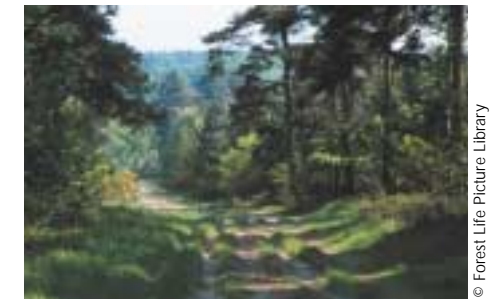
Thetford Forest, Santon Downham

Norfolk Wildlife Trust A fine example of ancient, semi-natural woodland. Specialities include spring flowers: bluebell, early purple orchid, wood anemone, and woodland birds including golden pheasant. Small car park. Access from A1075. Tel: 01603-625 540.